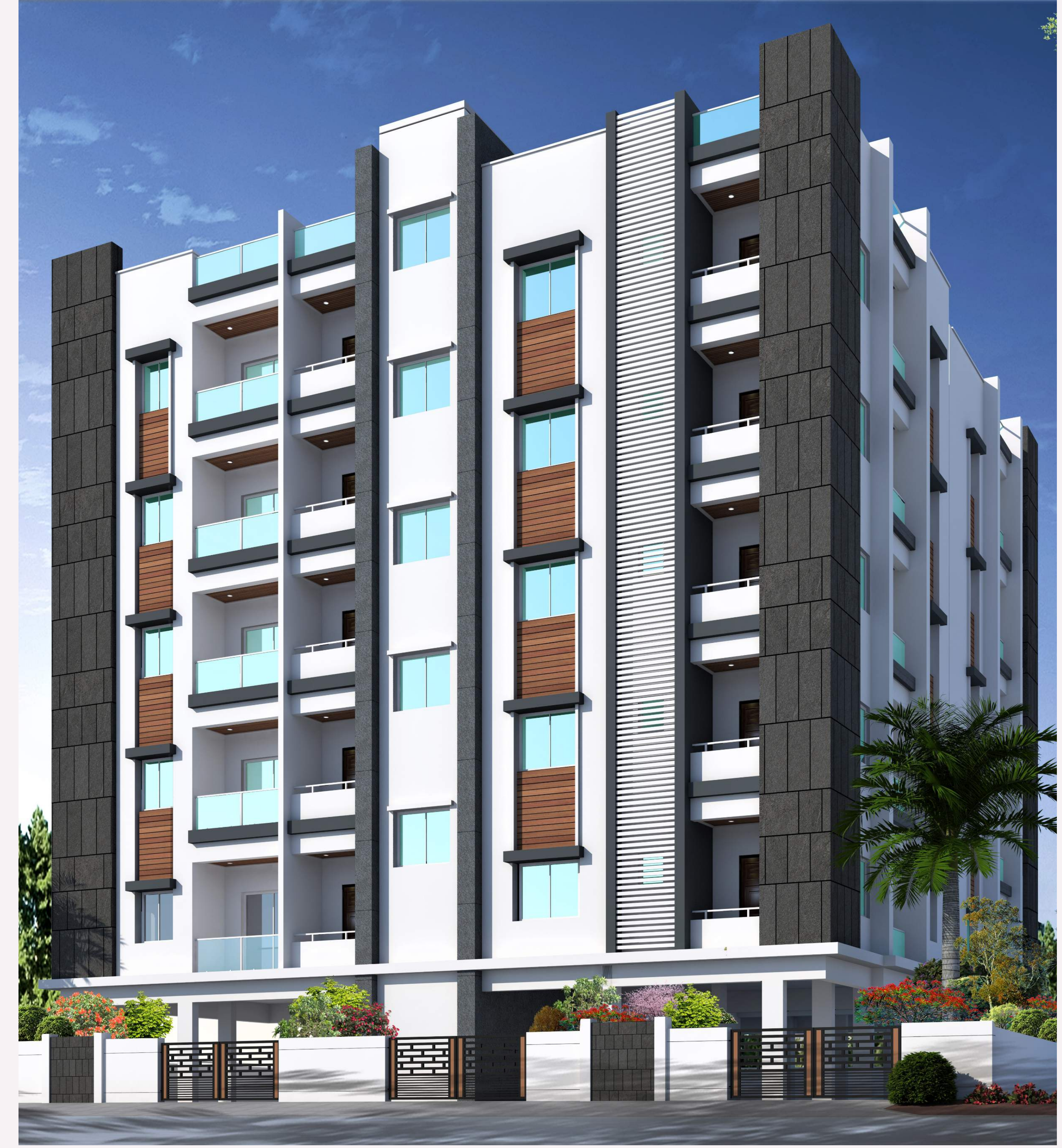
Seshadri Towers @ Beeramguda