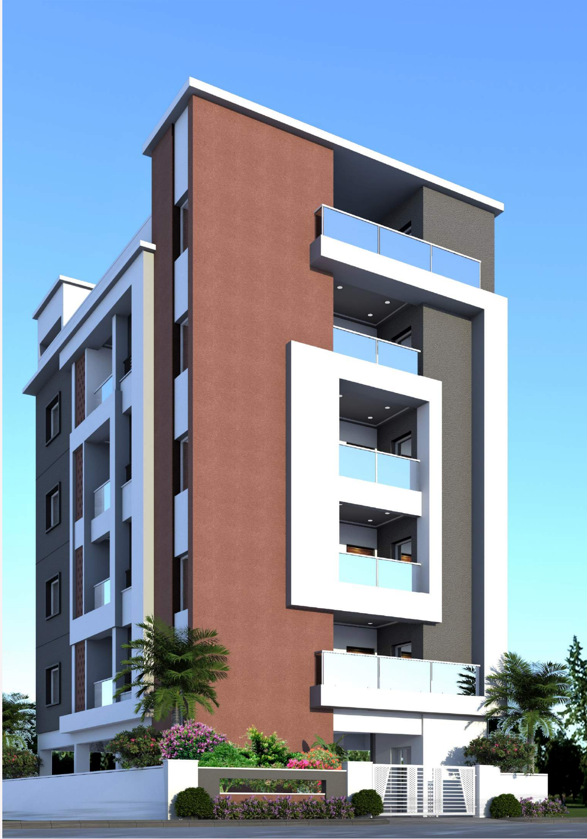
Neeladri Towers @ Vasanth Nagar, Kukatpally