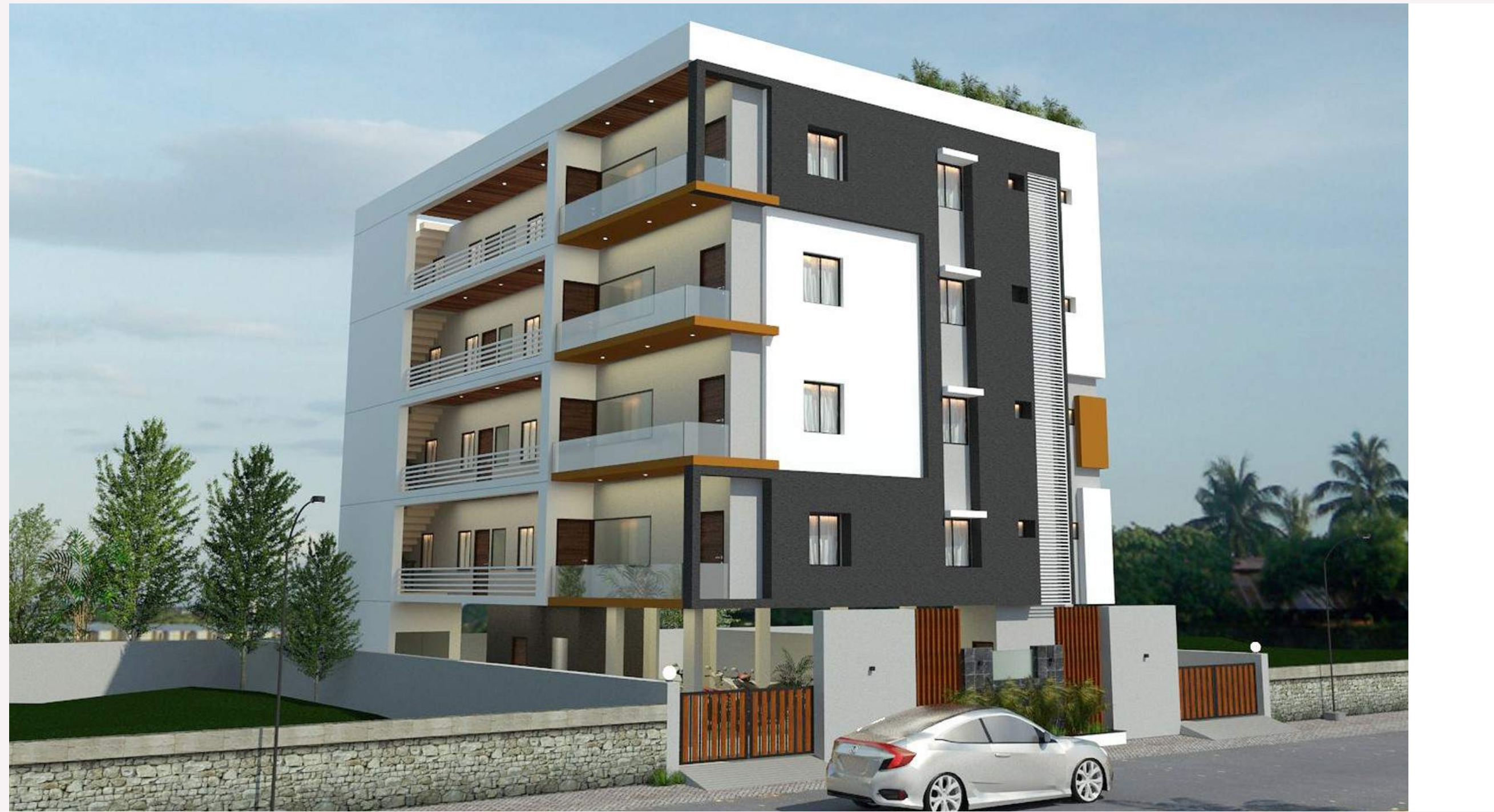
Vrushabadri Towers @Ameenpur