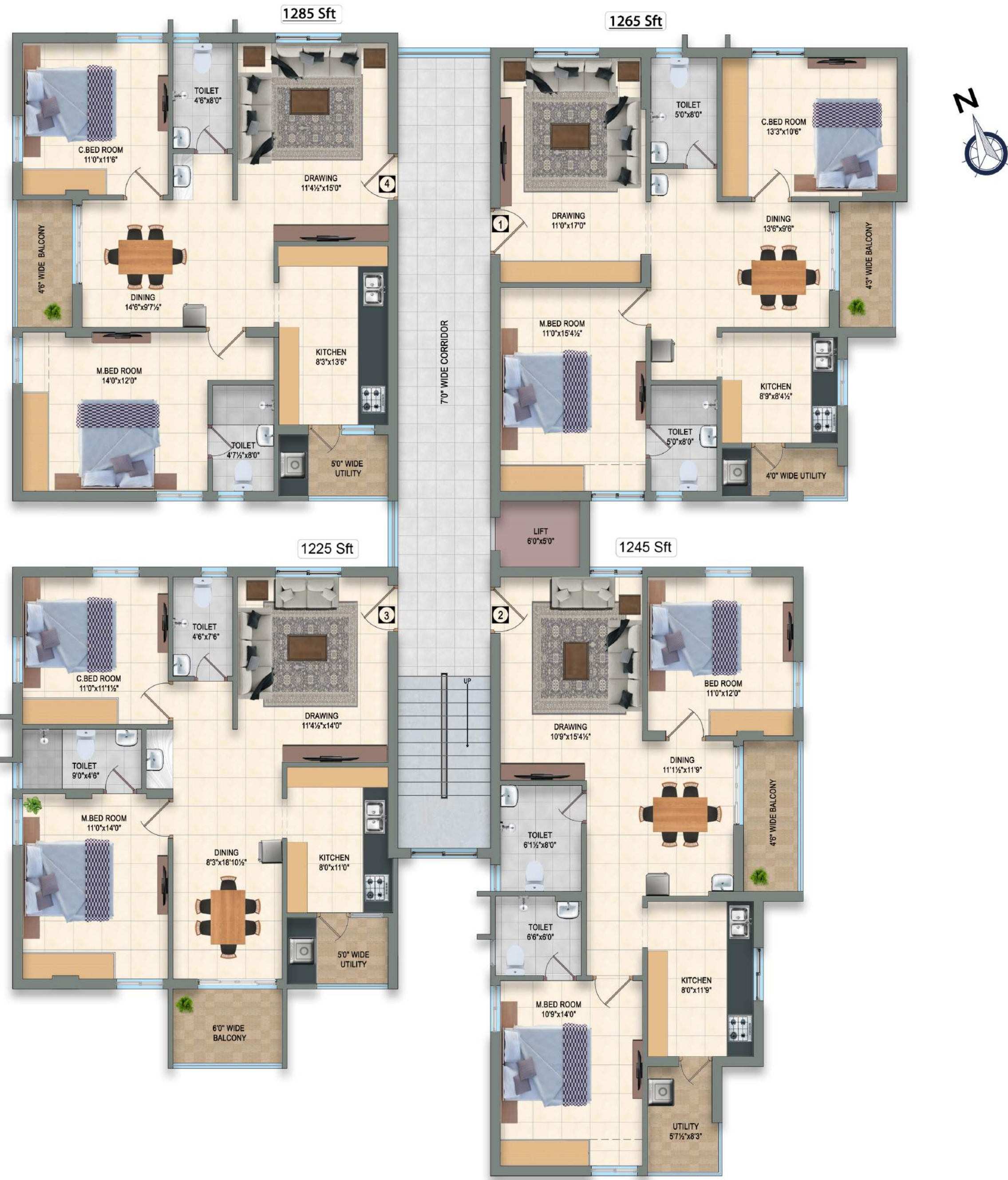
***TYPICAL FLOOR PLAN*** NARAYANADRI TOWERS